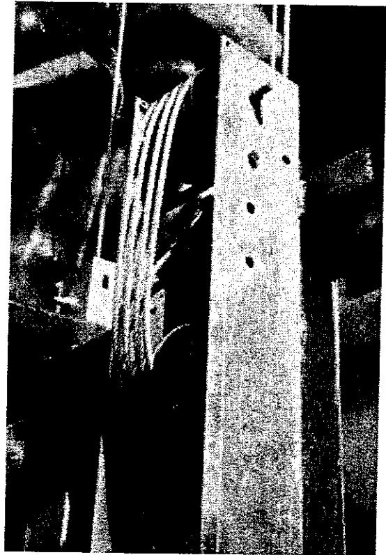
Fig. A1.2 Service Bulletin