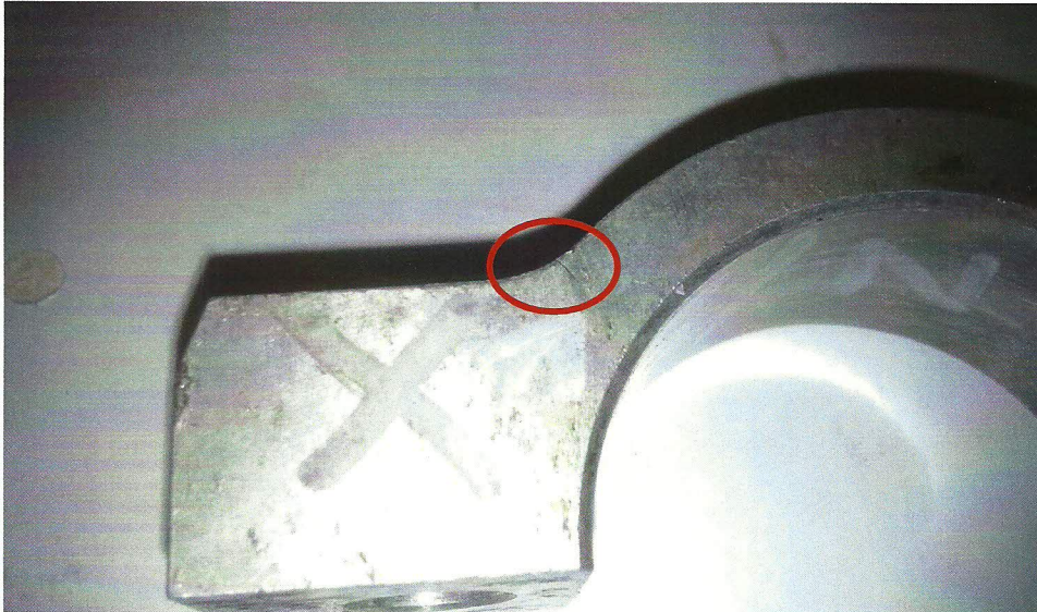
Figure 2 Cracks of bearing blocks

* In the interests of safety and as a service to the industry, Vekoma Rides Parts & Services B.V. issues technical information bulletins for the benefit of owners of amusement rides that are manufactured by Vekoma Rides Manufacturing B.V. (both companies are members of Vekoma Rides B.V.). These bulletins may also contain technical information, on parts or modifications relating to amusement rides, manufactured by Vekoma International B.V. and / or Vekoma Manufacturing B.V. These are dissolved companies which have no legal relationship whatsoever with Vekoma Rides B.V.